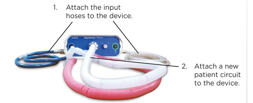
Fig. 1 - Connecting the Supply hoses and Patient Circuit

The patient circuit is attached to the gas outlet on the front panel of the control module by simply pushing the 22 mm taper over the outlet