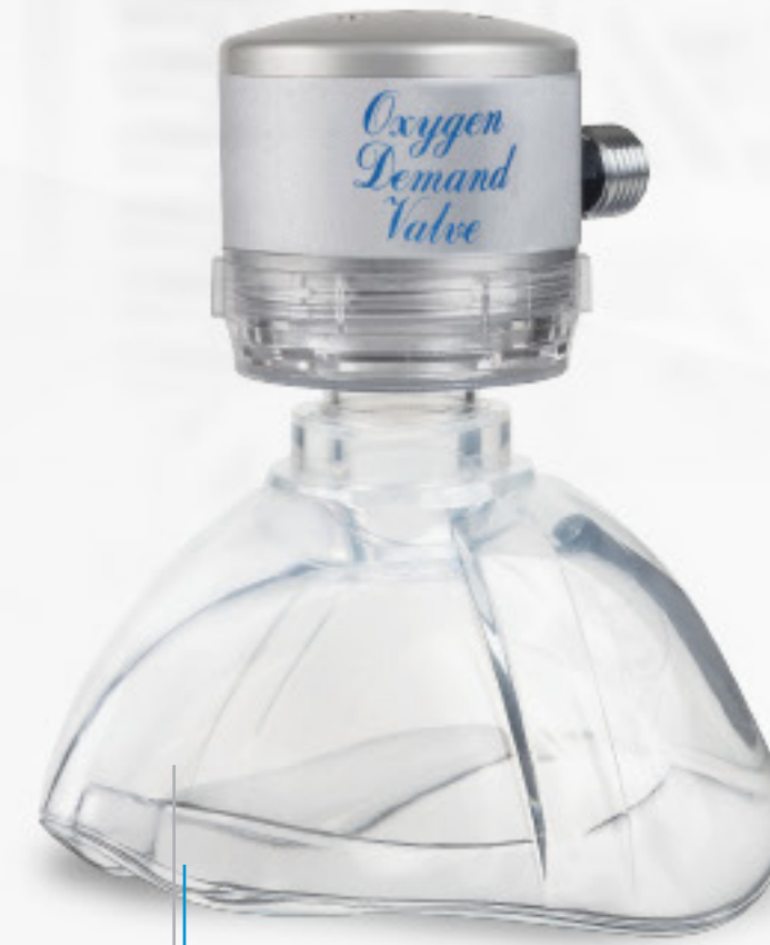
Oxygen Demand Valve

Our demand valve range is designed to provide spontaneously breathing patients with flow rates up to 140 L/min. These devices accommodate respiratory distress situations with minimal effort. The Oxygen Demand Valve provides 100% oxygen to the spontaneously breathing patient. The Demand Valve Resuscitator has the added benefits of manual ventilation button set at 40 L/min and a pressure relief system set at 60 cmH 2 O.