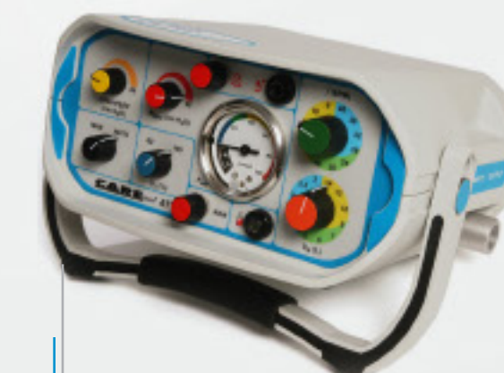
CAREvent® ATV +