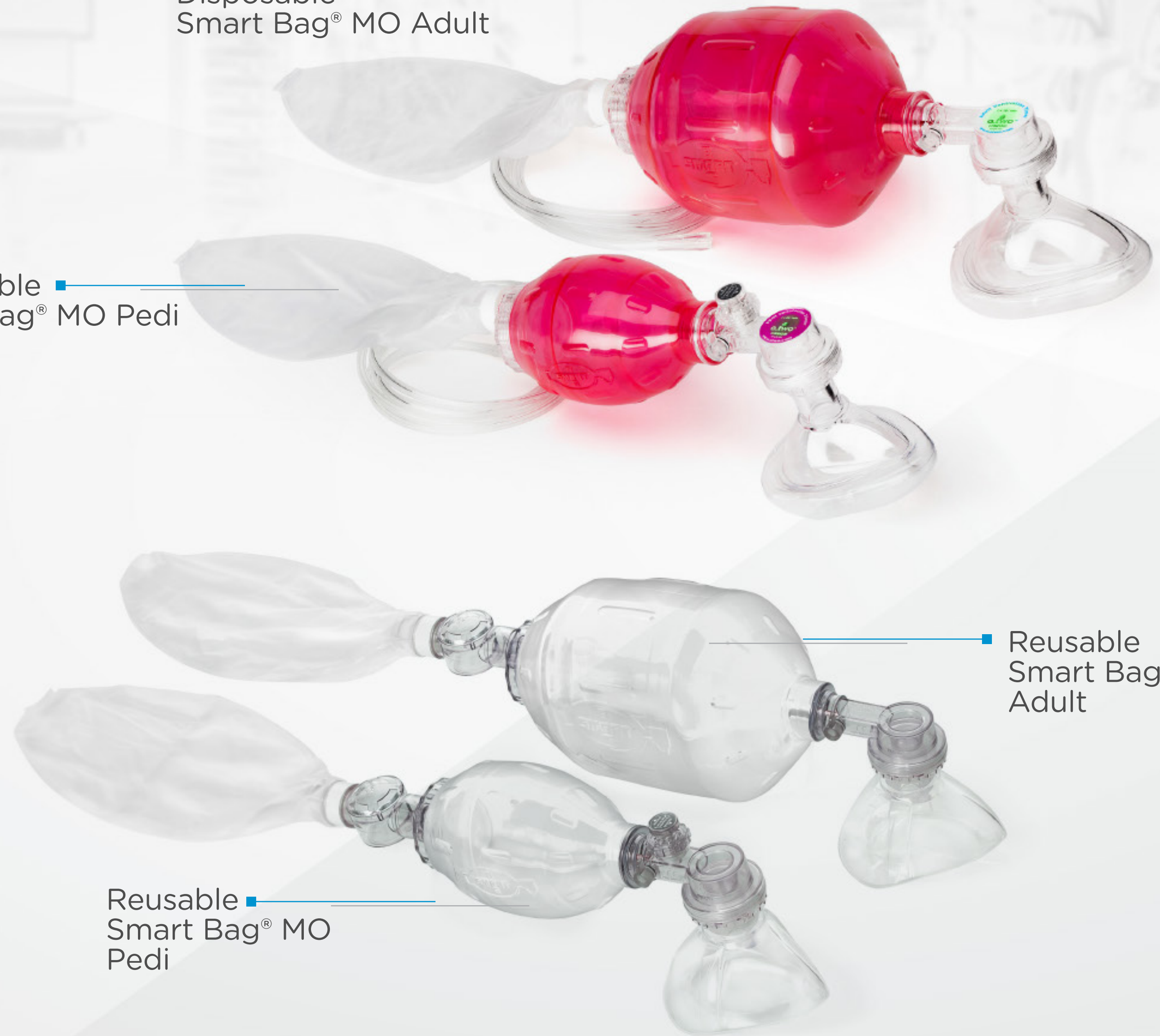
Reusable Smart Bag® MO Pedi