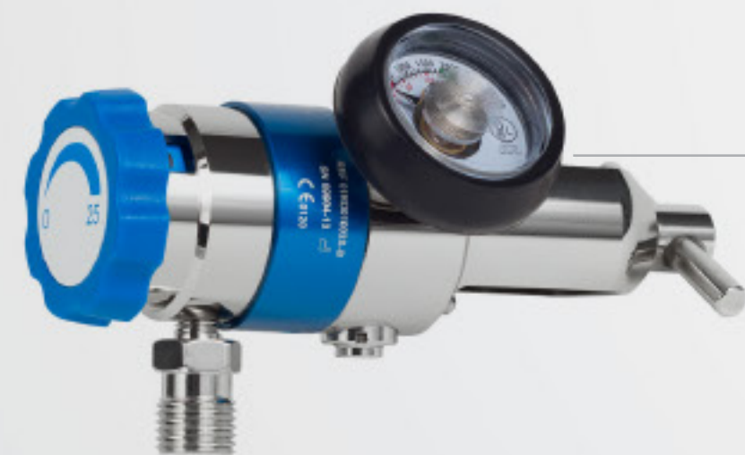
Pressure Only Regulator