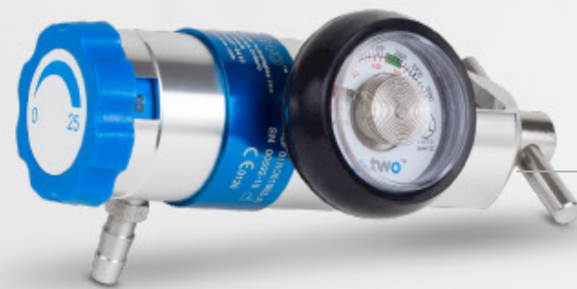
Flow Therapy Only Regulator