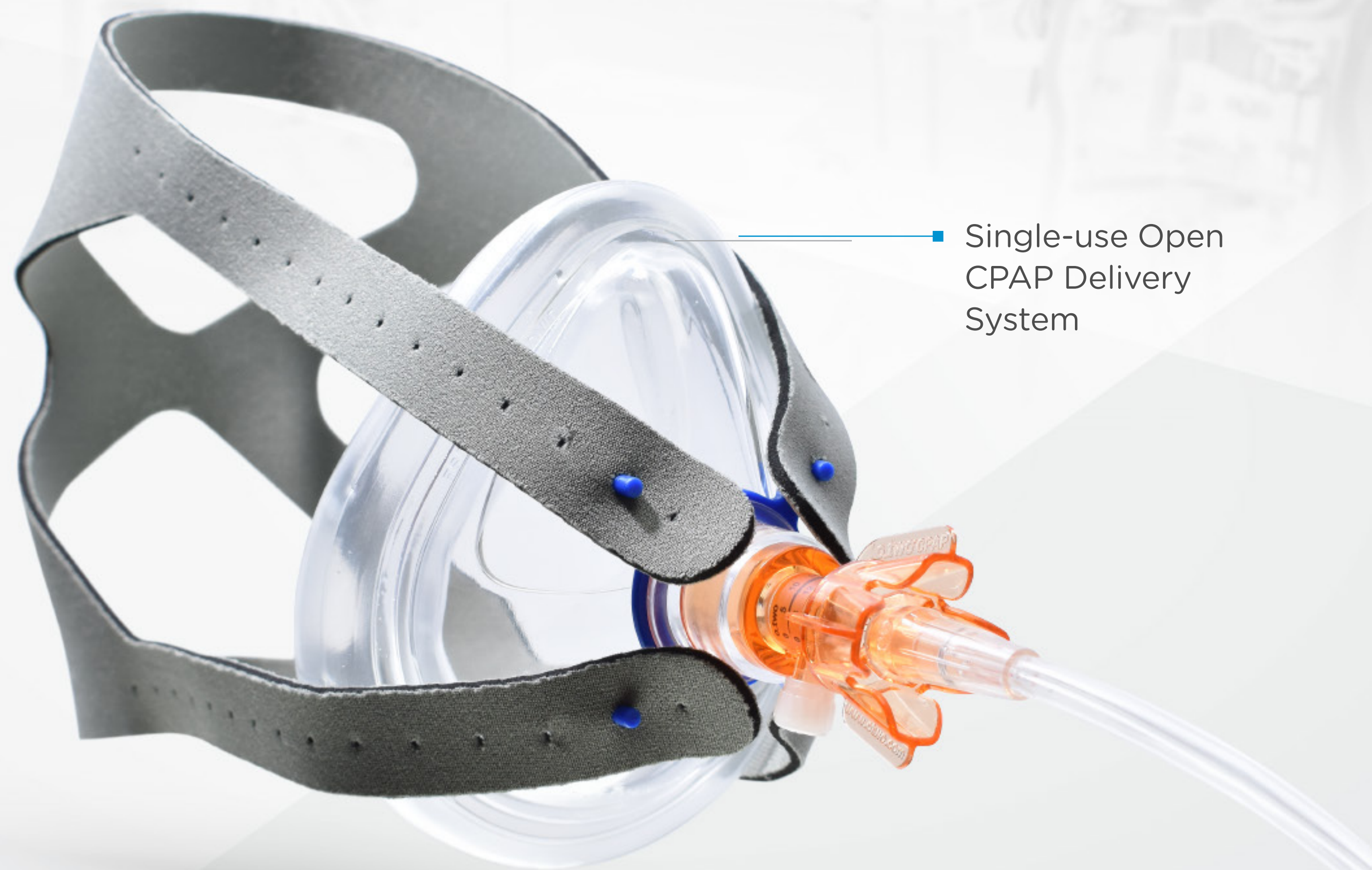
■ Single-use Open CPAP Delivery System