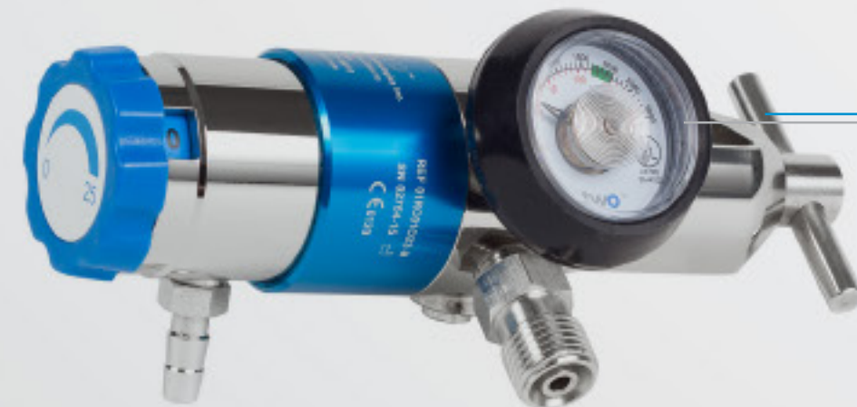
Pressure and Flow Therapy Regulator