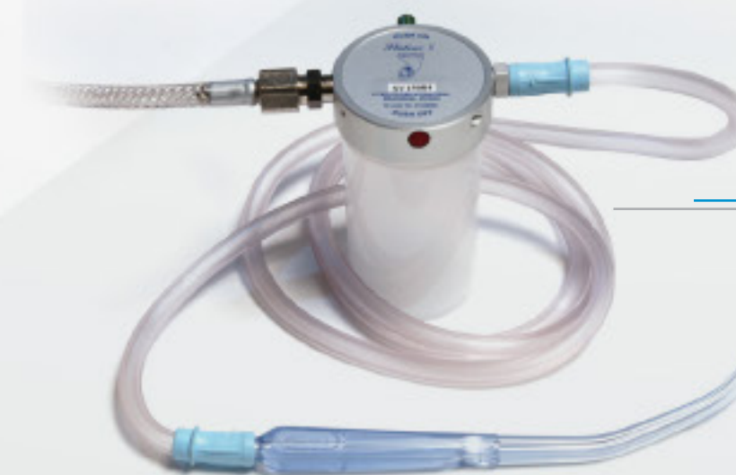
Statvac® II Aspirator

Our therapy Flow Controllers provide high levels of therapy flow accuracy and the StatVac® II aspirator provides simple suctioning for emergency airway care.