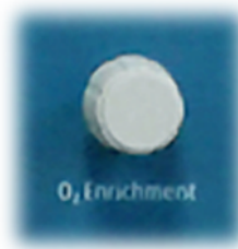
Fig 3. O 2 Enrichment button

An optional Oxygen Enrichment function on the Equinox® Relieve (01EQ1000F) allows the healthcare professional to provide a constant flow of 100% oxygen to the patient. Depressing the oxygen enrichment button provides a 30 L/min flow of 100% oxygen.