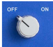
Fig 1. On/Off Control

The Equinox® Relieve provides spontaneously breathing patients with a preset mixture of oxygen and nitrous oxide for analgesia during painful procedures or to relieve the pain of trauma. The device has two input connectors for connection to hospital piped medical gas systems or nitrous oxide and oxygen cylinders through pressure regulators. The device has only one control for turning ON or OFF the device.